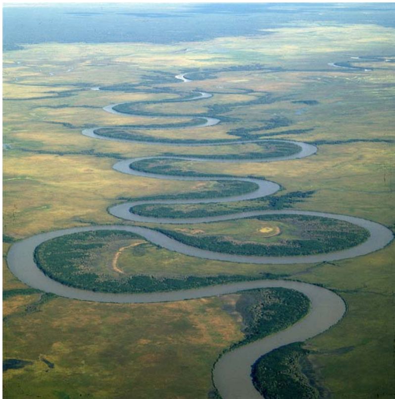
Fig 3. Adelaide River, NT, 1974.

Australia is the flattest inhabited continent and, after Antarctica, the driest. In the hinterland beyond the coastal fringing mountains, rivers wind serpent-like across the landscape. Onto that flat landscape falls one of the most variable rainfalls in the world and hence water bodies are extremely variable. Floods in such a flat country spread over vast areas. In dry times, rivers may lie around in waterholes or disappear entirely, flowing underground.