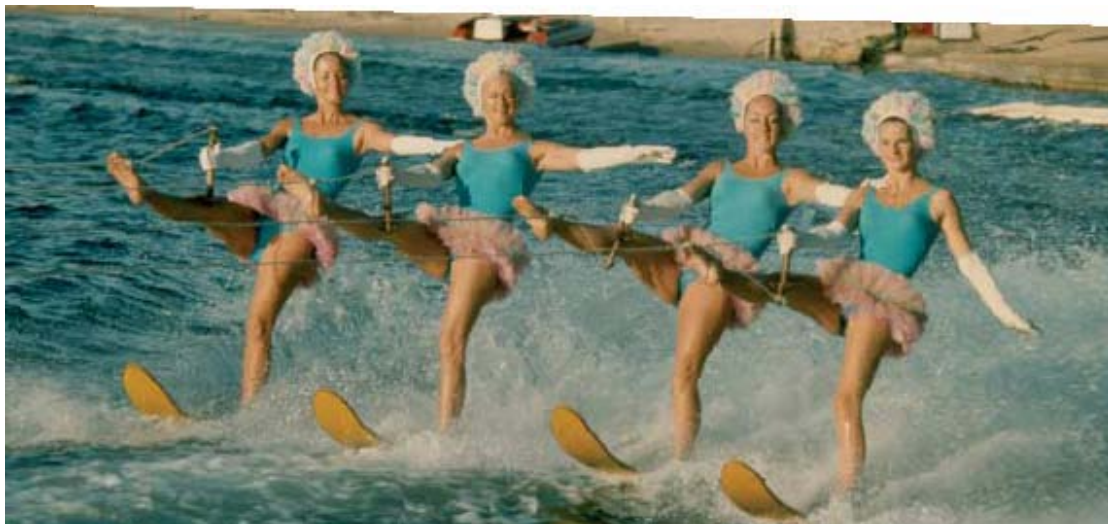
Fig 4. Dam recreation, Queensland, 1970s. Many of the permanent water bodies named as 'lakes' in Australia are in fact dams. Natural lakes are less likely to be permanent.

Water is now a permanent and transforming presence in country where it was once an ephemeral occurrence; its presence betrayed by the windmills that mark the bores, pumping up underground water. And the millions of farm dams seen shining across the landscape from the viewpoint of the passenger in a plane are evidence of millions of local transformations of a water system.