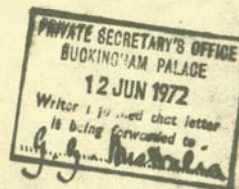
Fig 6. Plea for assistance to save Lake Pedder.

The dreaming and scheming for water projects that were not built – or at least so far – suggest another complexity. This is the attitude towards the land itself and the idea