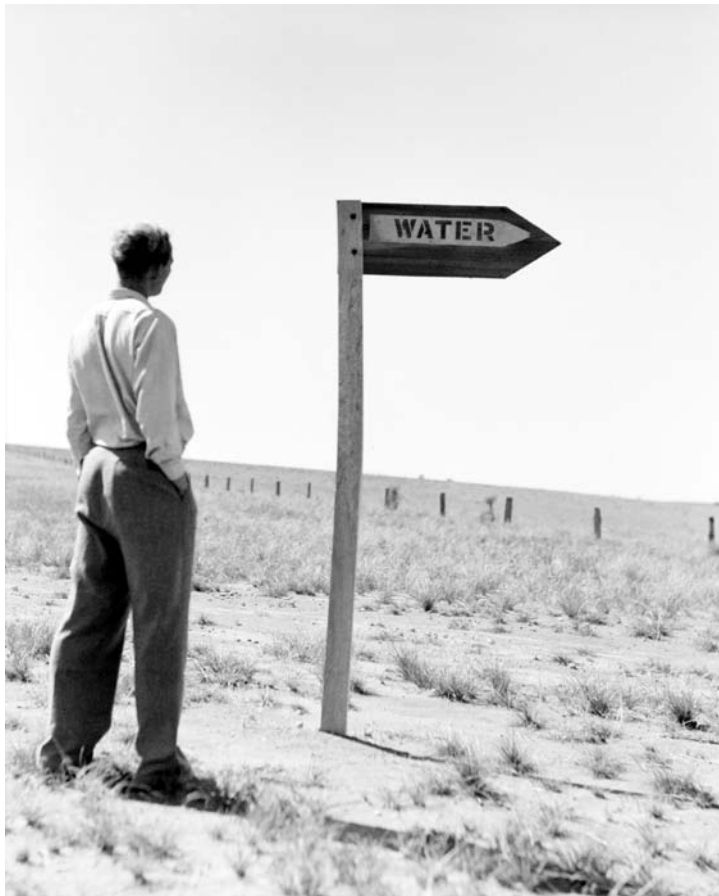
Fig 1. Sign pointing to the Murray River, c1946.