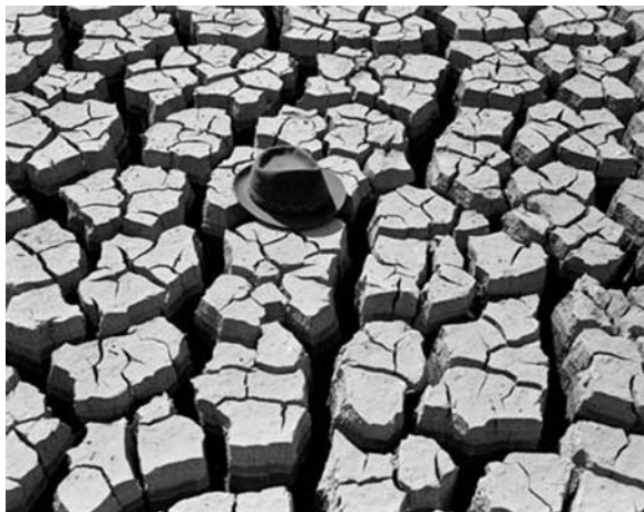
Fig 7. Burrinjuck Dam in drought, 1968.

They also reminded me of the divisions between urban and regional responses. One of the images I wanted to use in the exhibition was this: