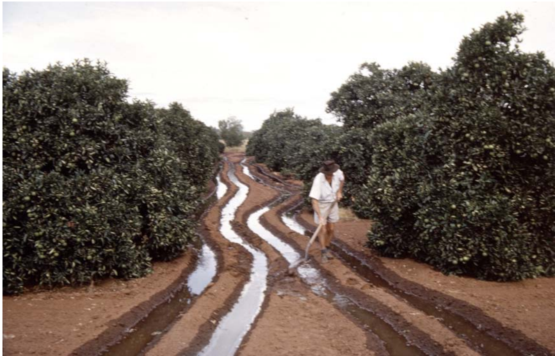
Fig 5. Irrigated orchard, Murrumbidgee Irrigation Area. National Archives of Australia.

The exhibition content therefore revolved around those aspects of water management which most closely related to our collection. So I included material on rainmaking, looking at attempts to increase rain through faith or through science. (The Archives contains many desperate letters begging the Prime Minister of the day to hold a National Day of Prayer for Rain, as well as those CSIRO documents on cloud-seeding.) I looked at dams and dam building, an activity which the Government has been heavily involved in since Federation. One of the first major infrastructure projects of the Government was the funding contribution to the Hume Dam on the Murray. The Archives holds extensive materials on irrigation projects such as the Murray-Murrumbidgee and the Ord, and many documents on the use of groundwater, including water-use in the Great Artesian Basin.